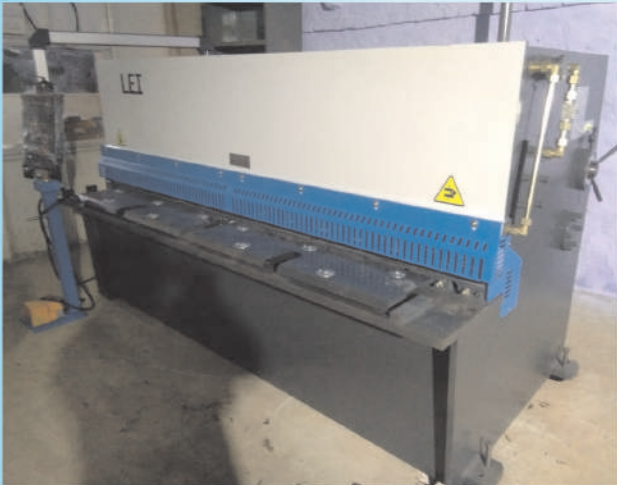
CNC SHEARING MACHINE