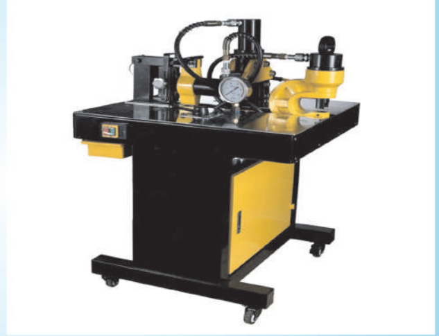
3 IN 1 BUSBAR PROCESSING MACHINE