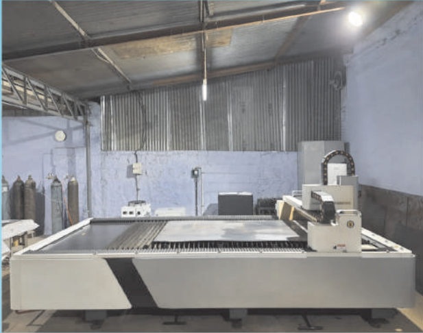
CNC LASER CUTTING MACHINE