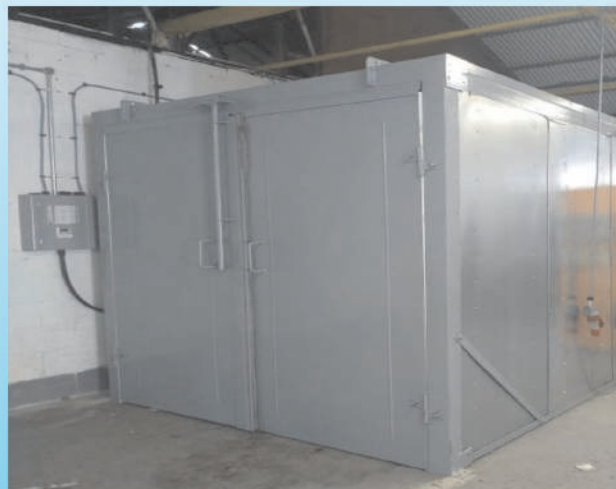
POWDER COATING OVEN