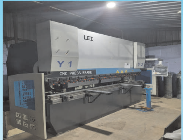
CNC 3.2M PRESS BRAKE